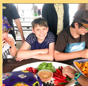
Healthy Food Options. All diets catered for.